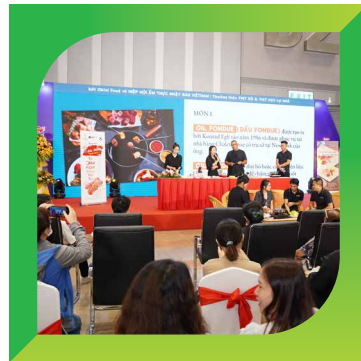
CULINARY PERFORMANCES TO HONOR VIETNAMESE AND INTERNATIONAL CULINARY CULTURE

TỔNG CÔNG TY THƯƠNG MẠI SÀI GÒN THÀNH VIÊN