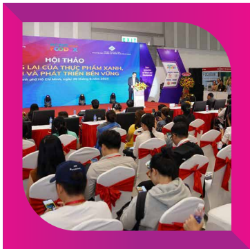
SPECIALIZED CONFERENCES / TALKSHOWS