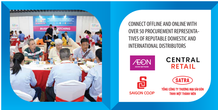
BUSINESS MATCHING (B2B)

CONNECT OFFLINE AND ONLINE WITH OVER 50 PROCUREMENT REPRESENTATIVES OF REPUTABLE DOMESTIC AND INTERNATIONAL DISTRIBUTORS